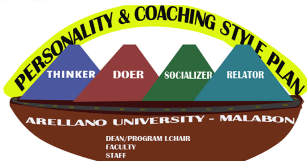
Figure 2 Development of Personality and Coaching Style Plan

It manifested to figure 2 about the conceptual paradigm of the study which focuses to the Input phase regarding the observed Personality and Coaching Style of selected Deans and Program Chair align with the concept of ThriVestry that incorporate leaders as Thinker, Doer, Socializer and Relator that will be assessed by the selected Deans and Program Chair, Faculty, and staffs in Arellano University-Malabon Campus.